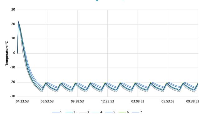
Temperature mapping is based on simulated 5 ml vaccine vials in 24°C ambient temperature