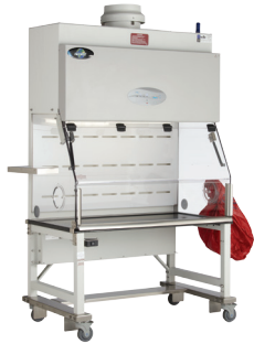
Class I Biosafety Cabinets