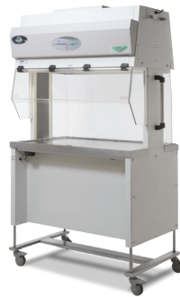
Animal Transfer Stations