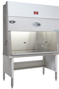
Class II Biosafety Cabinets