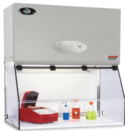
Vertical Laminar Airflow Workstations