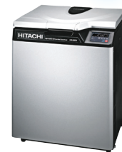
High Speed Centrifuges