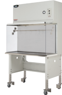
Horizontal Laminar Airflow Workstations