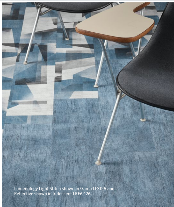
Lumenology Light Stitch shown in Gama LLS126 and Reflective shown in Iridescent LRF6-126.