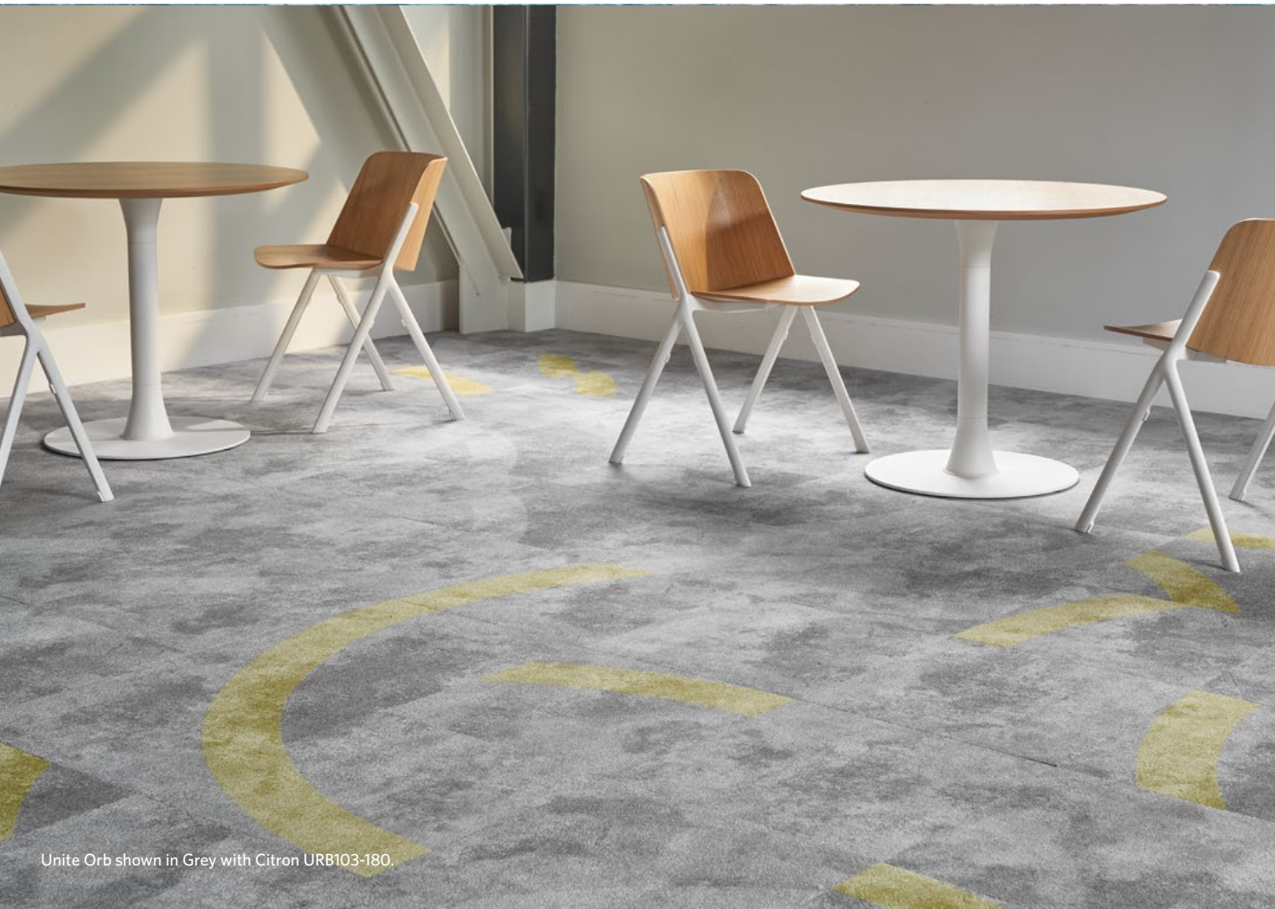
Unite Orb shown in Grey with Citron URB103-180.