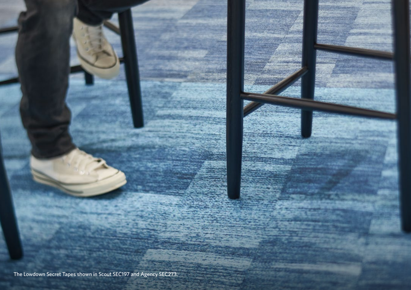
The Lowdown Secret Tapes shown in Scout SEC197 and Agency SEC273.