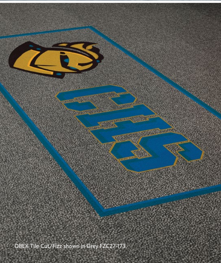
OBEX Tile Cut/Fizz shown in Grey FZC27-173.