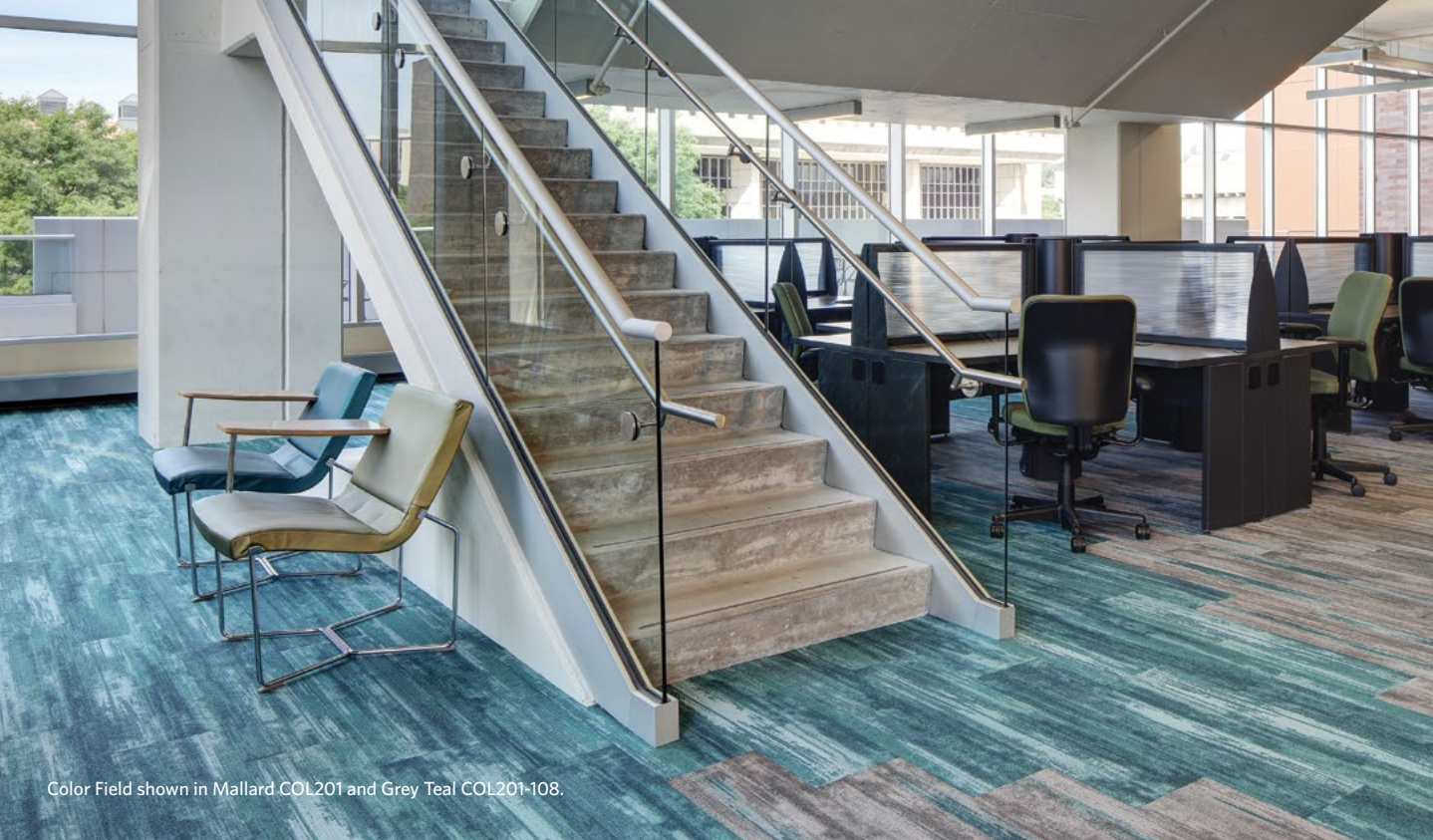
Color Field shown in Mallard COL201 and Grey Teal COL201-108.