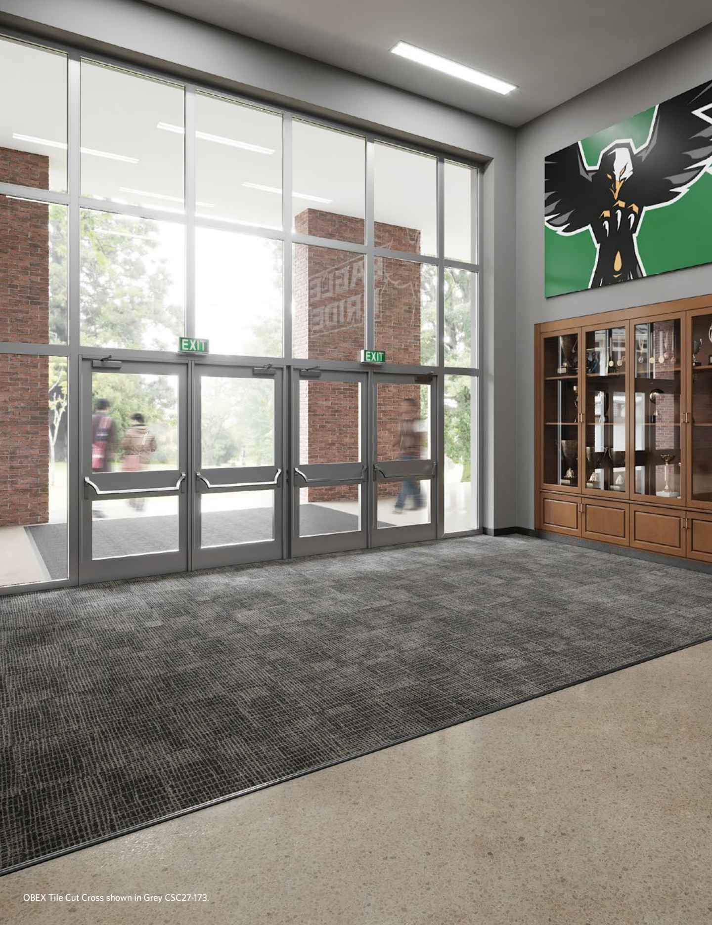
OBEX Tile Cut Cross shown in Grey CSC27-173.