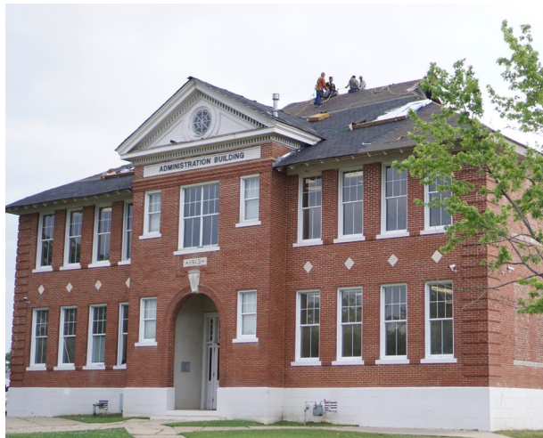
Sheridan School District’s Admin Building, built in 1913, still operational today, and required special attention during district-wide roofing project