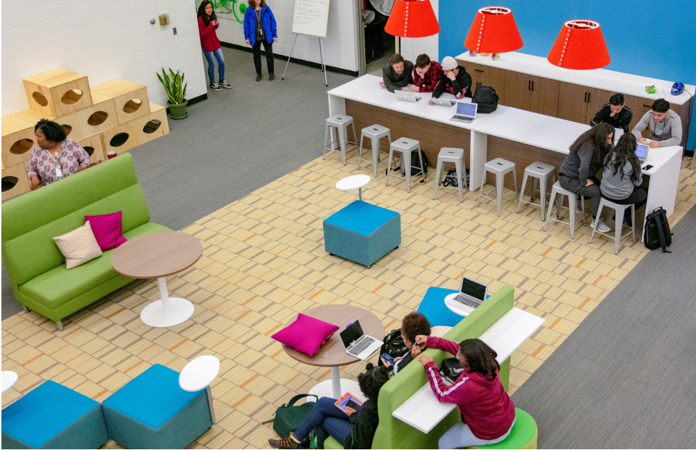
Local dealers meet the needs of community schools through a national manufacturer, such as this classroom by OFS Brand Furniture