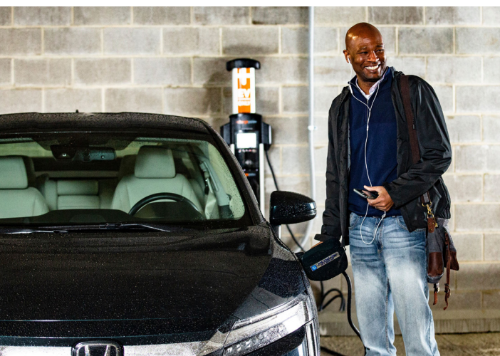
Employees using city-owned pool cars help support the environment and save money through reduced fuel costs

With more than 10 million public and private fleet vehicles currently on the road using more than 95