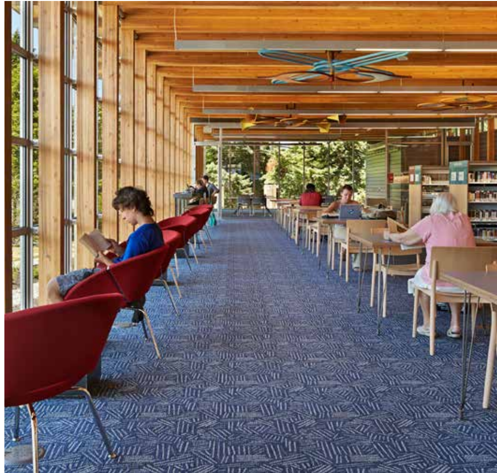
CUSTOM DESIGN - monolithic tile installation

“From a specification standpoint, Milliken floor covering is remarkable. However, what empowers the product is the ability for it to be more than just great. It can transform into what King County Library System represents and initiate a unique sense of place for each project.”