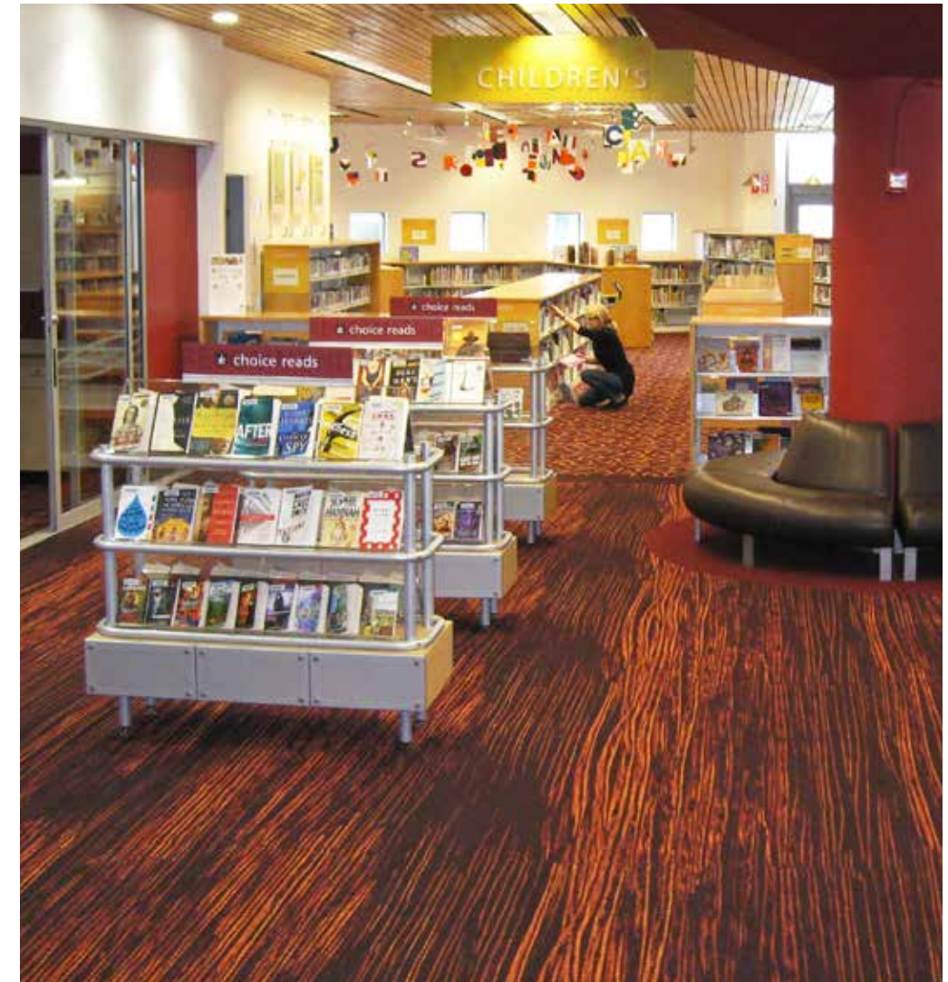
ALTERED FORM - Landlines (front) and Micro Flower Field (back) in Solar, monolithic tile installation

This case study highlights how Milliken floor covering technology silently works to provide optimal environments for life-long learning – functionally, aesthetically, experientially, and fiscally.