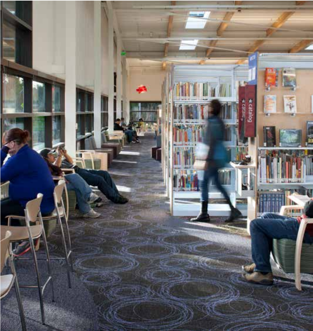
CUSTOM DESIGN - monolithic tile installation

Using the best possible floor covering is particularly vital in children's areas. With children reading, sitting, and crawling on the floor, the carpet is the most experienced surface. These everyday tactile interactions require that products be safe, healthy, and extremely durable.