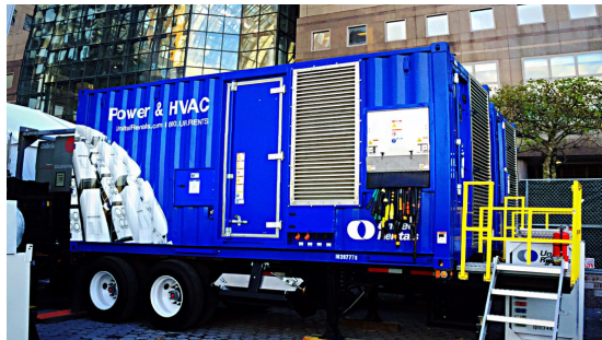
Power & HVAC Solutions

In critical situations, having a single source provider can make all the difference. United Rentals supported the construction and operation of 25 alternative care facilities and various testing sites throughout the country. During the recent pandemic we've rented in all 10 FEMA regions to contractors and directly to federal, state and local agencies. We've also sourced equipment from all over the country to meet the needs of our customers during the pandemic and natural disasters.